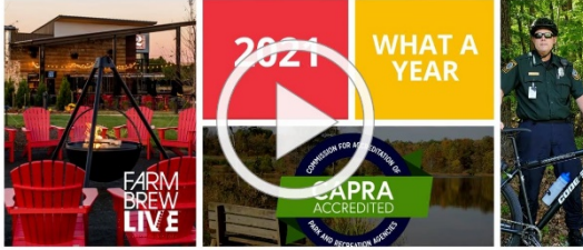
State of The Parks Video Address